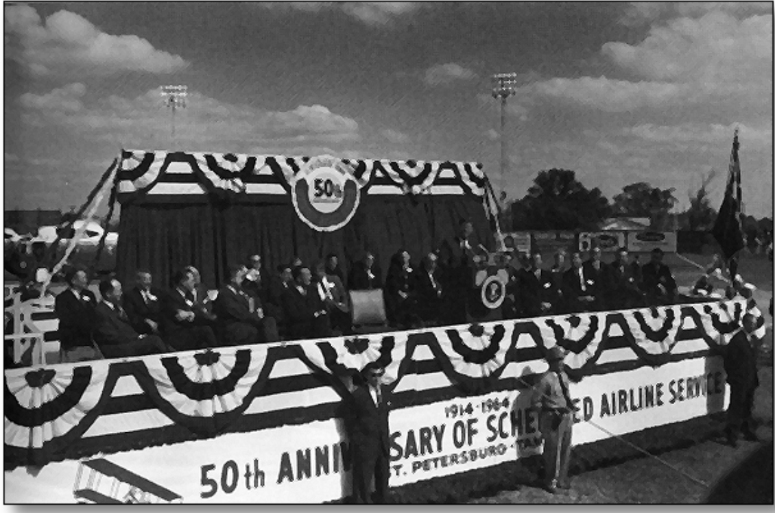
President Kennedy speaking at Al Lopez Field on November 18, 1963. Congressman Sam Gibbons is seated to his left.

Photograph courtesy of the John F. Kennedy Library.