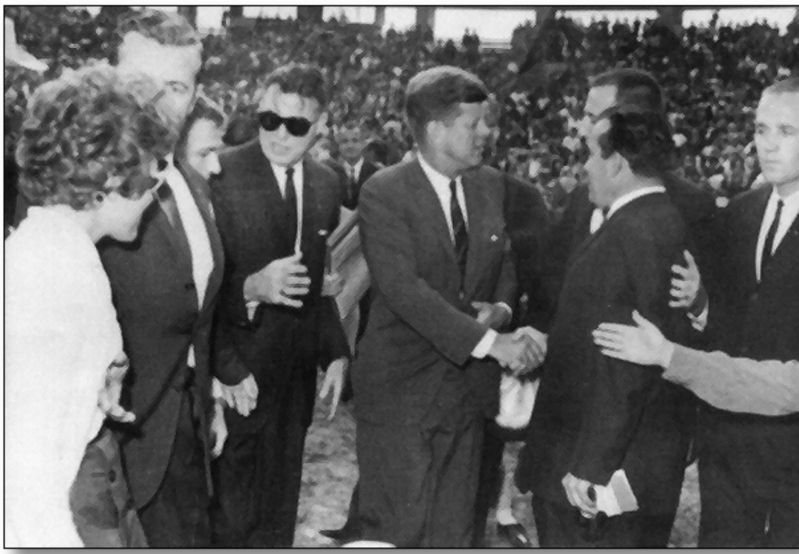
President Kennedy speaking at Al Lopez Field, greeting local dignataries, including Congressman Sam Gibbons at whom he is looking.