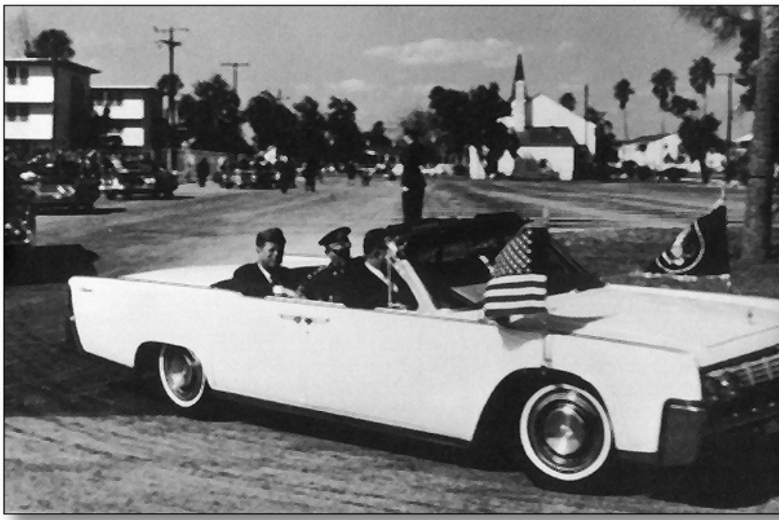
The Kennedy motorcade in Tampa.